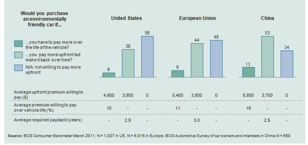
Exhibit 2 | 6% of US and 9% of EU consumers are willing to pay more over the life of the vehicle for green cars; ~50% are unwilling

The penetration for hybrid and electric vehicles in the U.S. has been consistently growing in the past ten years and peaked at 3.8% of vehicle sales in 2013. In the past two years, it has declined to 2.9%, due to the cheaper price of gasoline. This is due to the fact that only 6.0% of U.S. customers are willing to pay more ($4,600/car on average) for a more environmentally friendly car without payback. Another 38% of customers are willing to pay on average $3,900/car<sup>2</sup>, but they require a payback of less than three years on their investment. As prices of gasoline decline, the payback period of hybrid vehicles becomes too long. We note that another 56% of customers will not spend any more on their car for fuel efficiency or lower emissions (see exhibit 2).