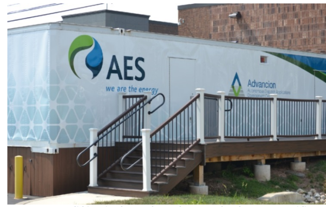
A two megawatt lithium-ion battery located at PJM's headquarters providing frequency regulation.

In this way, we have helped bring about the vision of open access and competition that emanated from this Committee back in 1992 with the passage of the 1992 Energy Policy Act. And along the way, we have embraced an "all of the above" strategy that has enabled the PJM markets to serve as a home for innovative new technologies, ranging from energy storage to demand response, as well as more conventional resources such as coal, nuclear and natural gas. The policy embraced by