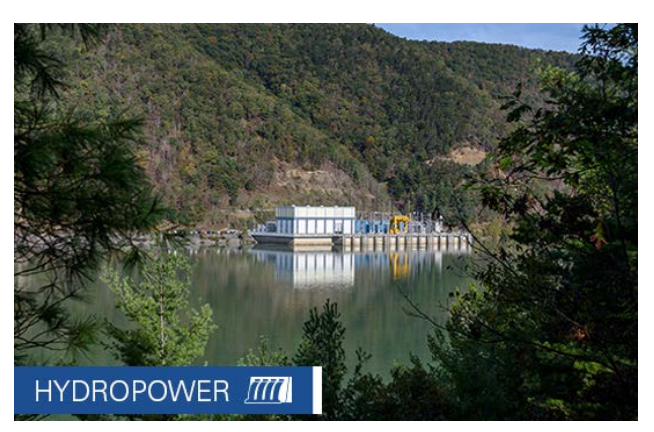
Bath County Pumped Storage Station, the world's most powerful pumped hydro facility.

• Pumped Storage Hydro: PJM has approximately 5,000 MW of pumped storage hydro, including one of the largest pumped storage hydro plants in the world — the Bath County Pumped Storage hydro facility on the border of Virginia and West Virginia. Most of our pumped storage hydro facilities were built decades ago to provide peaking capacity to meet customer demands. These facilities have proven to be highly effective, flexible resources that we integrated into our system years ago and continue to rely upon every day.